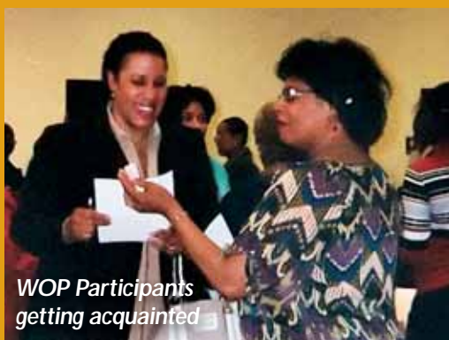
WOP Participants getting acquainted