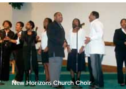
New Horizons Church Choir