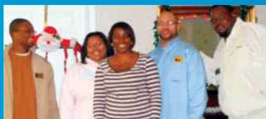
Members of the Intercessory Prayer Group and Autumn Glen Residents.