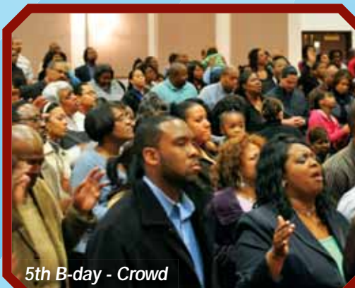
5th B-day - Crowd