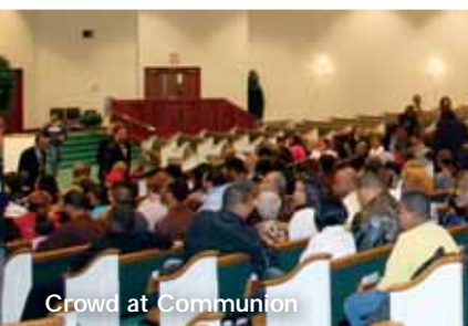
Crowd at Communion